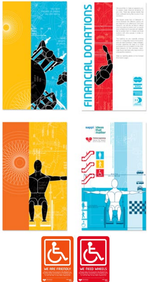
Photo: The fundraising and awareness Campaign for Tshwaraganang Centre for People with Disabilities which received a R200 000 grant.

The second leg of the Tshwaraganang campaign was launched in February 2006 and entailed a fundraising campaign as well as an awareness campaign aimed at the top management of the campus.